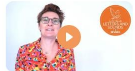
How to say Phase 5 sounds

https://www.littlewandlelettersandsounds.org.uk/resources/for-parents/