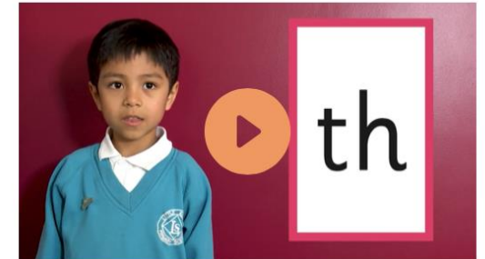
Phase 2 sounds taught in Reception Autumn 2