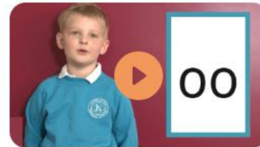
Phase 3 sounds taught in Reception Spring 1