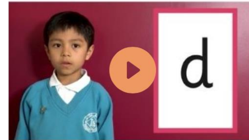
Phase 2 sounds taught in Reception Autumn 1